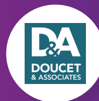
Doucet & Associates